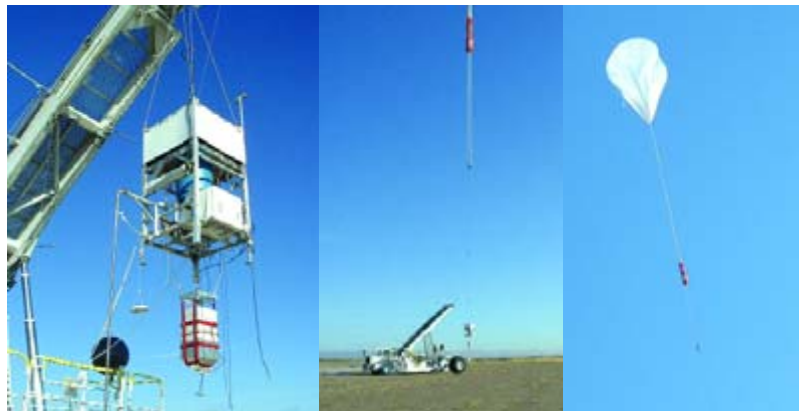
Boering used air samples collected in a number of ways, including by balloon.

But currently, scientists are stuck with “could” and “might,” because some pieces in the puzzle of atmospheric inputs and outputs might still be missing. After careful study, scientists know a little more about the budget of hydrogen in the stratosphere, where interactions are relatively simple. But in the troposphere (the earth's atmosphere below an altitude of 5 to 9 miles), where oceans, power plants, and forest fires complicate the picture, scientists are less certain of the hydrogen balance.