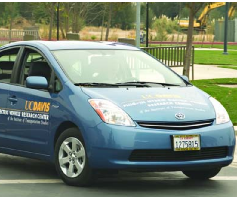
Researchers at UC Davis are studying drivers' reactions to the Toyota Prius plug-in hybrid.

For an extra $15,000, a few Californians have taken their Prius relationship to the next level. But what are they getting out of this new relationship? A few researchers at Davis decided to investigate.