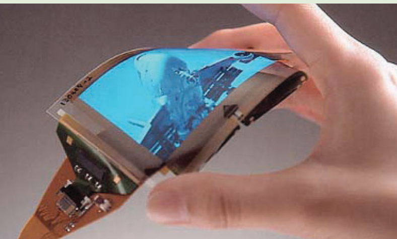
Flexible organic semiconductor display made by Pioneer.

Yang, on the other hand, believes that the technical challenges can be overcome, perhaps within five to seven years. Right now, he says, the biggest barriers are the stability of the polymer and the encapsulation technology. Additionally, more research is needed on the structure of the device and on flexible substrate materials. “Practically, once the efficiency of the plastic solar cell reaches 10% or higher, it has a chance to compete with the silicon solar cell,” Yang says. ■